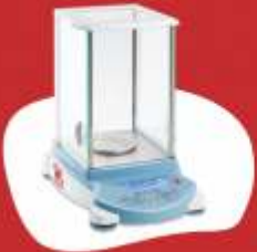
Analytical Adventurer Pro