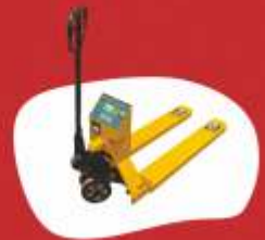
Pallet Truck Scale