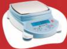
Precision Adventurer Pro