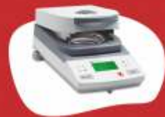
Moisture Analysis MB 35