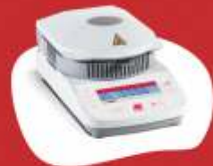
Moisture Analysis MB 25