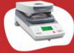
Moisture Analysis MB 45